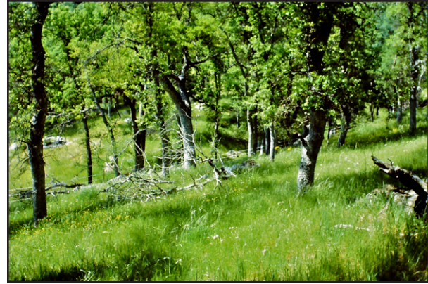
Figure 1. Overview of blue oak woodland study site in Tulare County, California, USA.

Each tree was harvested at a stump height of 0.15 m in 1995. We cut a tree round at the